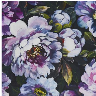
Secret Oasis Ultra Violet