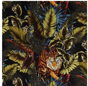
Bengal Tiger Amazon