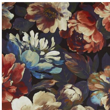
Secret Oasis Heritage