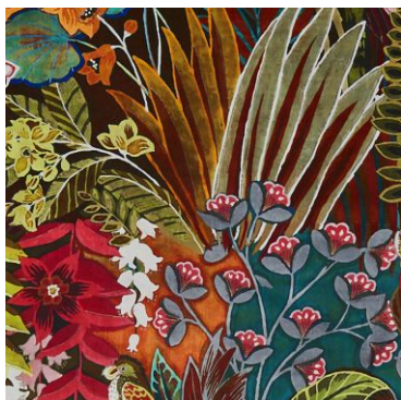
Hidden Paradise Calypso