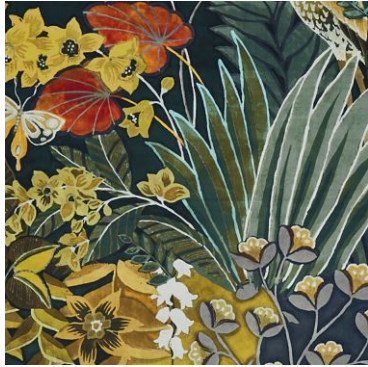
Hidden Paradise Emerald

Maximalism takes a new direction in Journey Beyond. The adventure unfolds through five printed velvets, featuring restored archive artwork, dramatic tropical vistas, prowling tigers and distressed damask motifs. Used individually, the designs are a talking point, combining bold colours and patterns to spectacular effect.