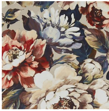
Secret Oasis Rouge