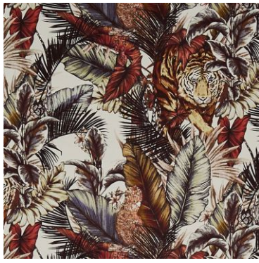
Bengal Tiger Safari