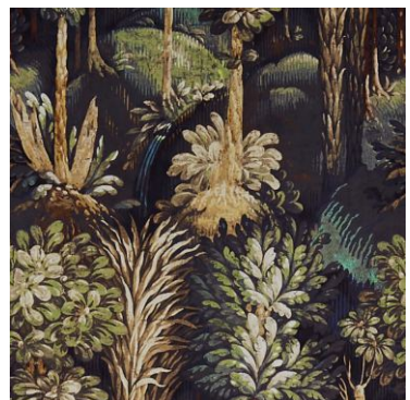
Forbidden Forest Ebony