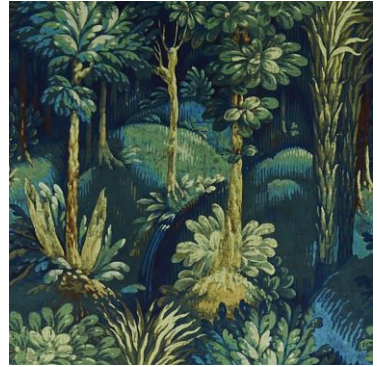
Forbidden Forest Sapphire