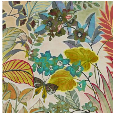
Hidden Paradise Pastel