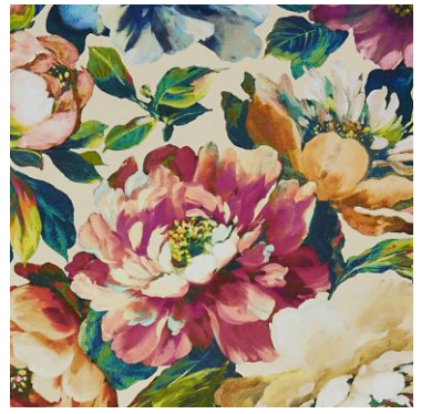
Secret Oasis Jewel