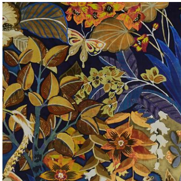
Hidden Paradise Midnite