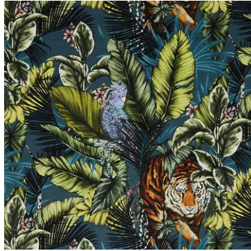
Bengal Tiger Twilight