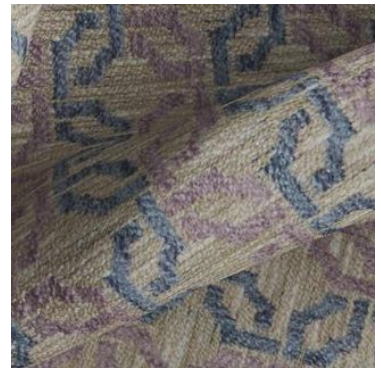
Reggae Bon Bon