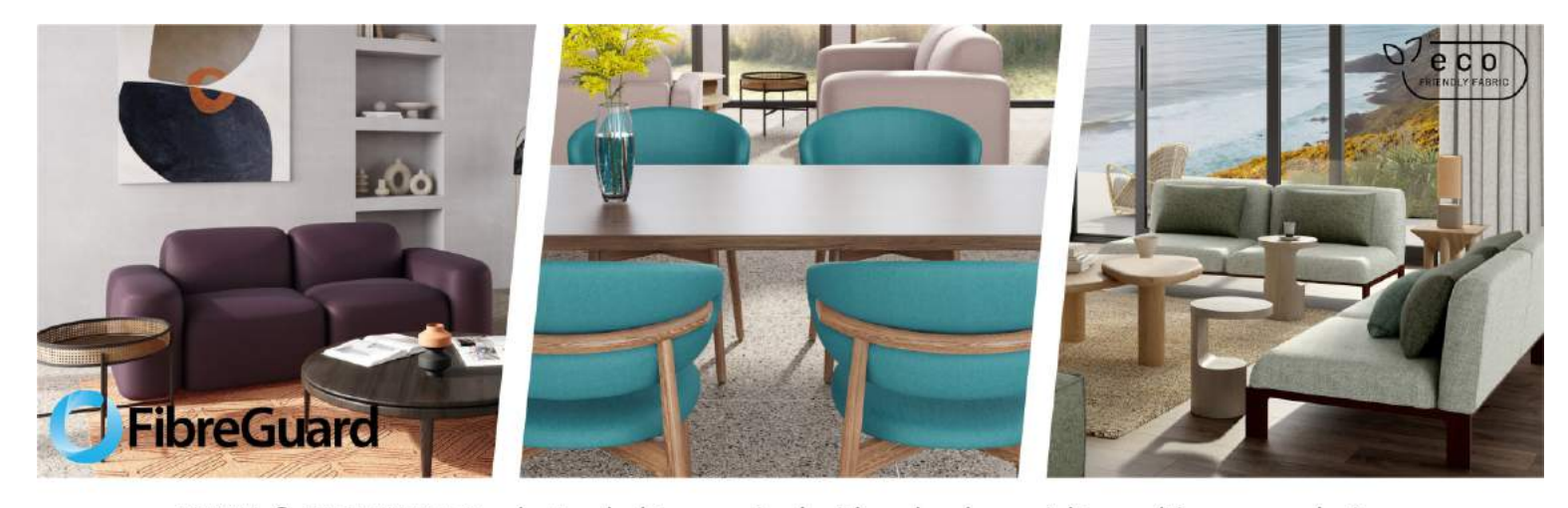
DIANA & EARTHWILD ~ velvet upholstery, paired with a chunky, weighty multi-purpose design

Environmentally friendly and highly functional this collection offers a supreme solution for the hospitality and medical fields. Diana is a soft, beautiful velvet upholstery, while Earthwild is full of complexity, creating a nest like texture which is usable for a variety of purposes.