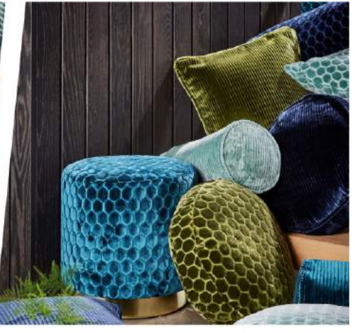
VOLUME ~ dynamic duo of cut velvet designs

Introduce your space to the depth and luxury of Volume. A dynamic duo of cut velvet designs give a nod to the iconic Art Deco era, with the collection's embossed effect guaranteeing true decadence. A palette of jewel tones, spanning vibrant teals and emerald greens to warming copper shades, enhances the opulence created by the collection's tactile finishes. Complement curved furniture, accessories, and gold finishes with Volume's rich, cocooning tones for a truly indulgent space.