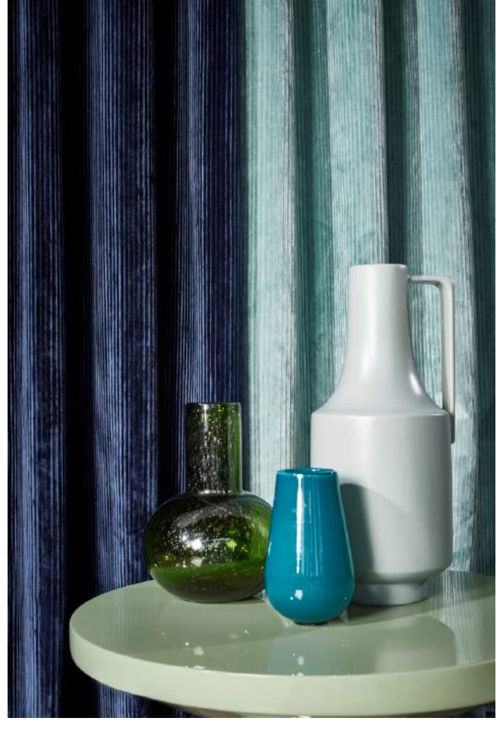
Volume Prestigious Collection - Page 3/3